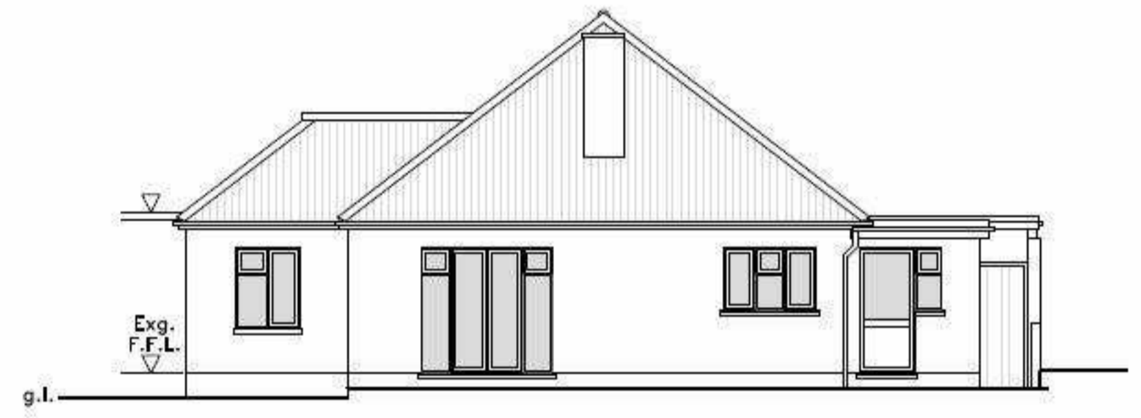
EXISTING REAR ELEVATION EAST