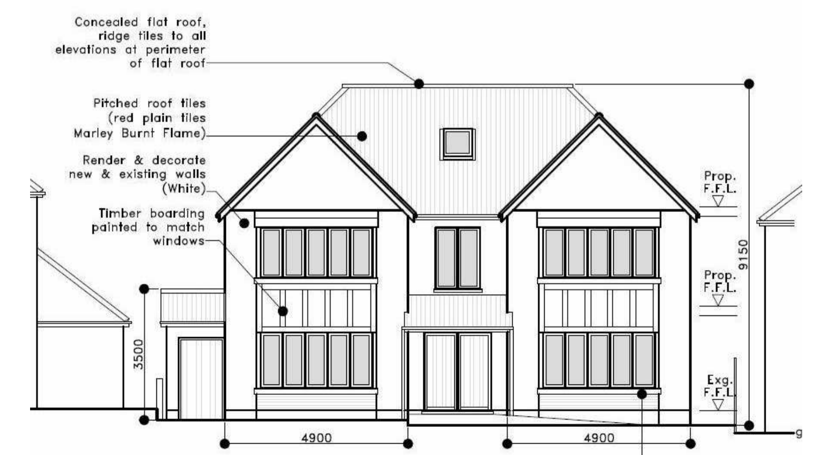
Approved Front Elevation 1 : 100