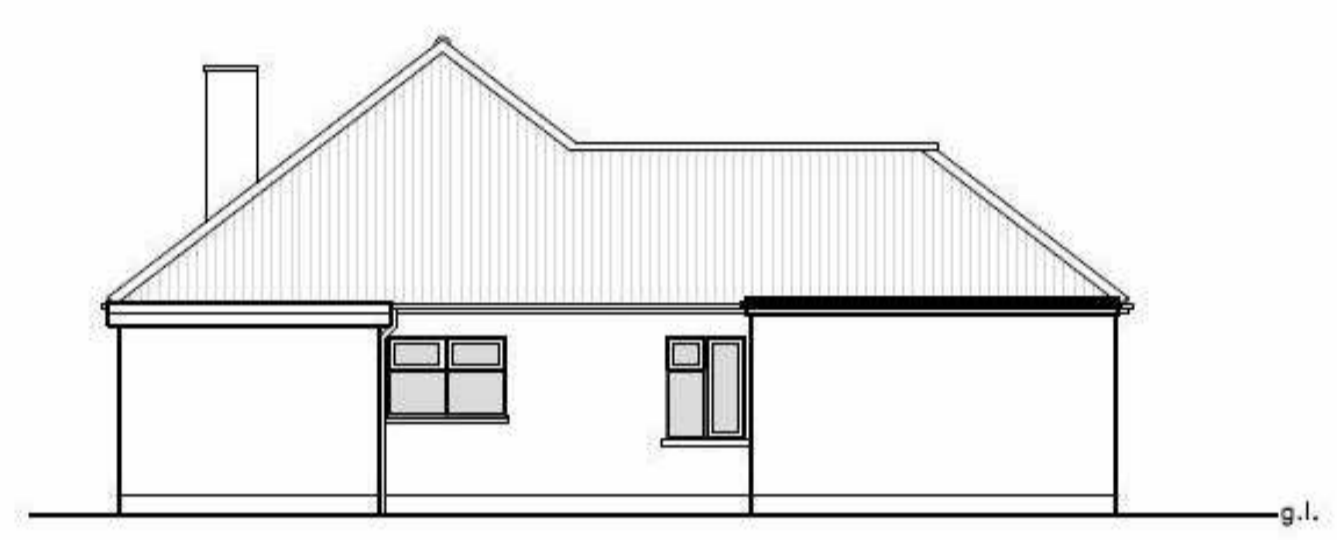
EXISTING SIDE ELEVATION NORTH