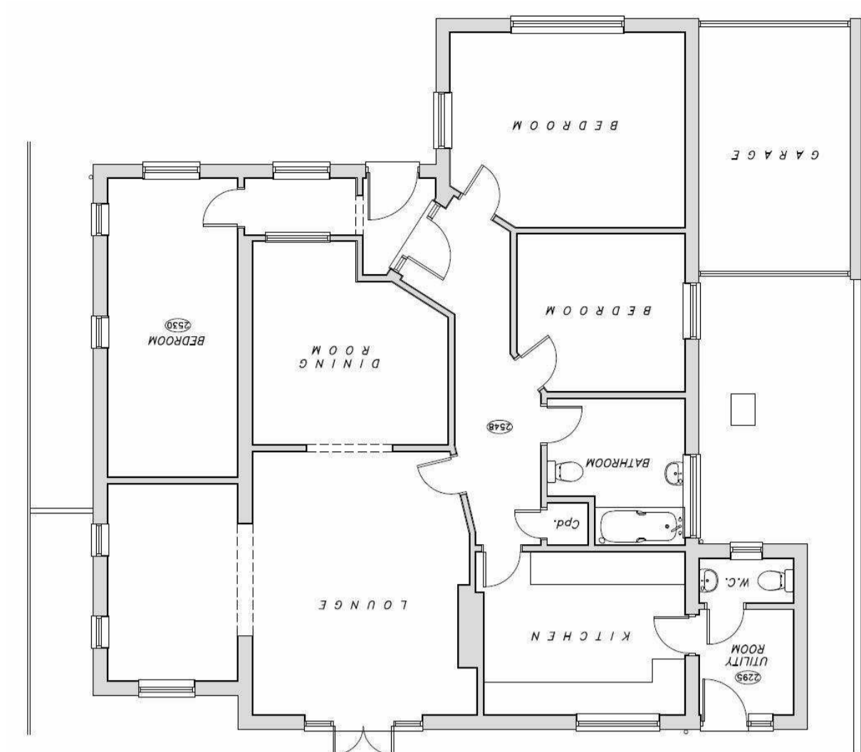
Existing Floor Plan 1 : 100