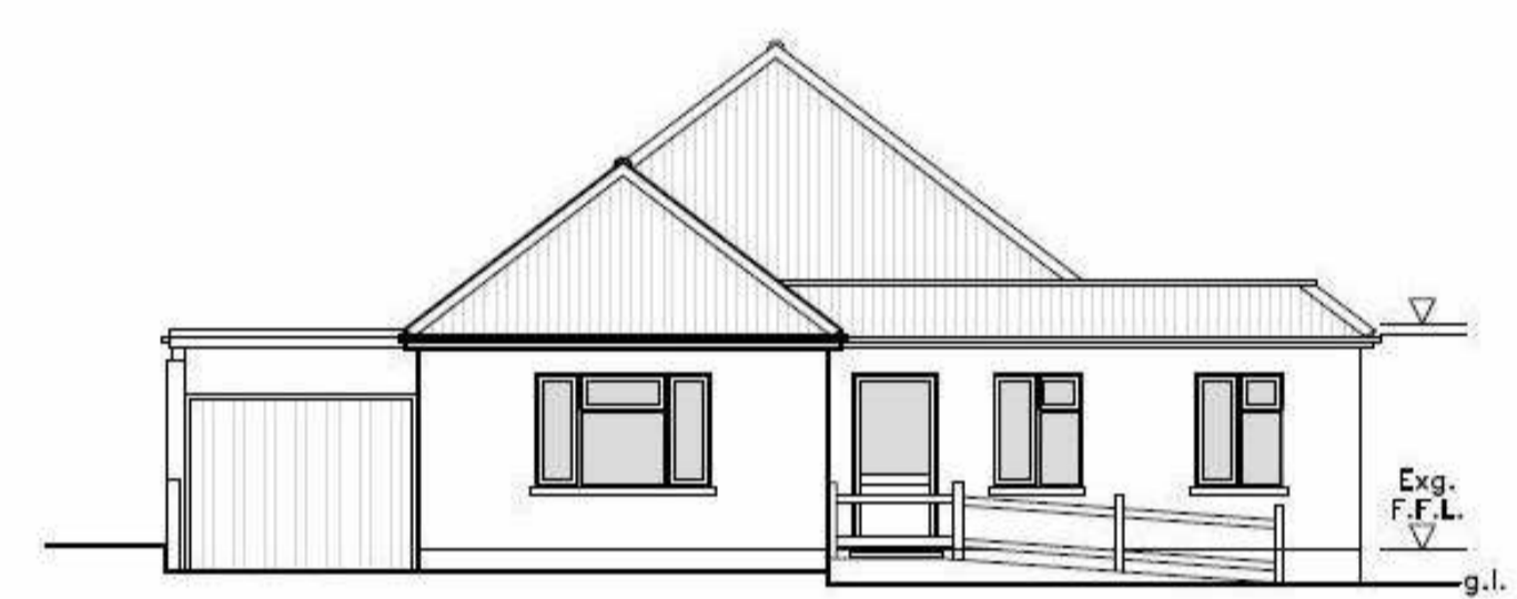
EXISTING FRONT ELEVATION WEST