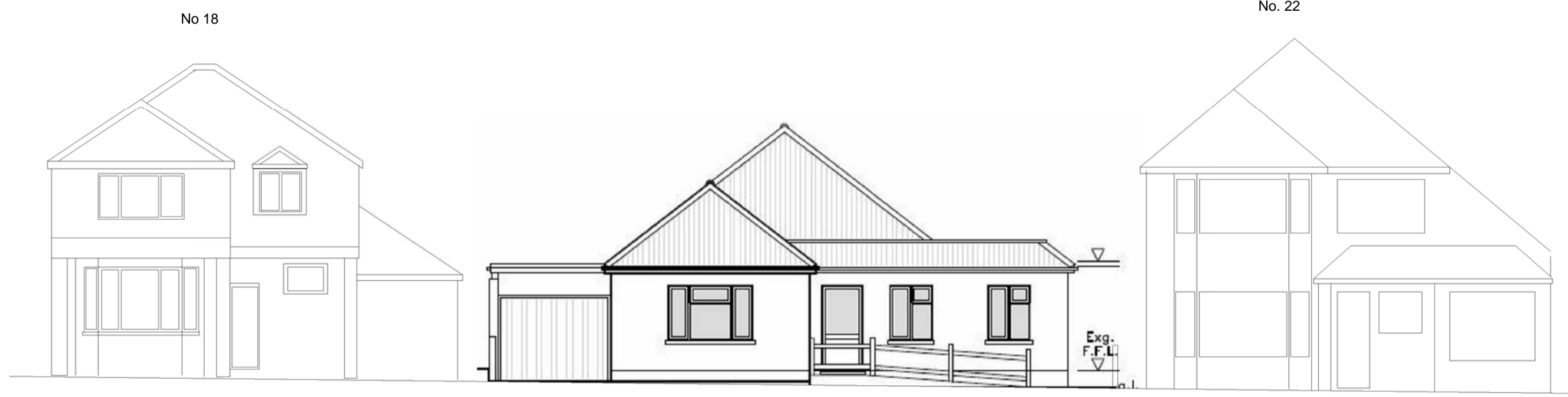
Existing Front Street Scene 1 : 100

Notes All dimensions and or load-bearing walls to be checked and agreed on site as correct by contractor prior to commencement of works and ordering of materials. Any discrepancies to be reported to DK Building Designs prior to commencement of works. DK Building Designs will accept no responsibility for works commenced on site prior to planning approval (if relevant) and building control approval. Plans are copyright and are not to be used without consent from DK Building Designs. If applicable, clients / contractor to liaise with neighbours to abide with party wall act etc All beam calculations (if applicable) as per separate sheet. All stated spans of beams on calculation sheet are clear spans only between supports. Contractor to confirm all spans on site and if applicable to add end bearings prior to ordering. Beams to cover full length of padstones.