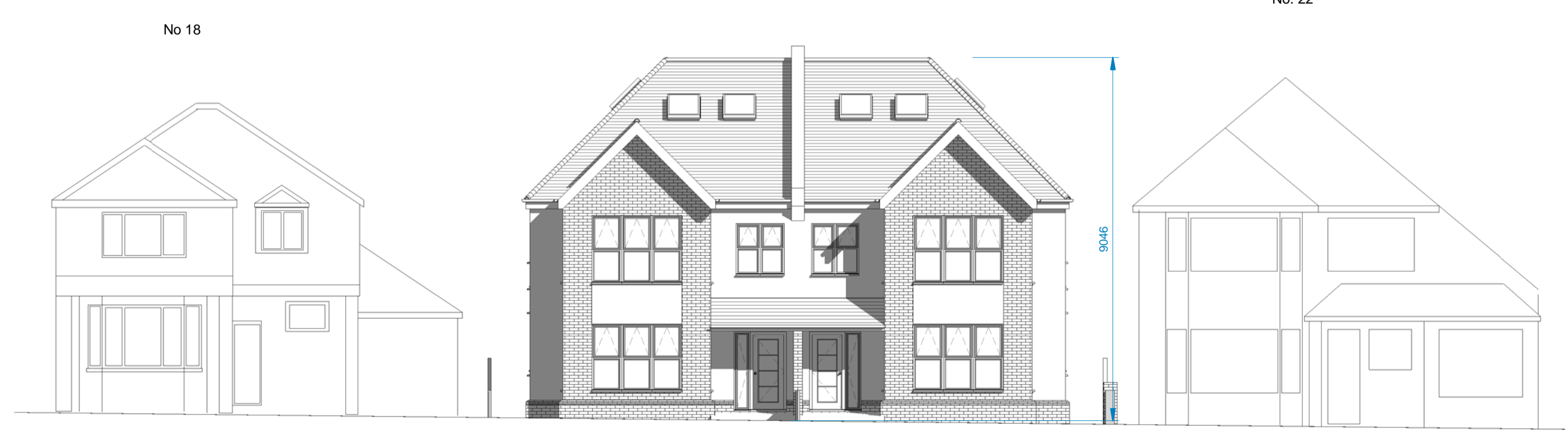
Proposed Front Street Scene 1 : 100